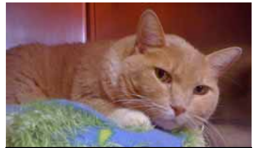
~ Benny ~