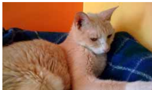
~ Koko ~

It is never easy to say goodbye. These special shelter cats were dearly loved and will be missed by us all.