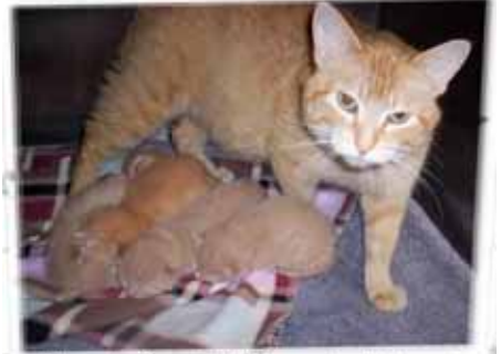
Help make it my last litter or I might make YOU my cat sitter! Spay & Neuter your pets!