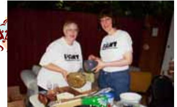
There were plenty of volunteers to help sort through items for the sale. It was tempting, too, as several of us saw some things we wanted. So much great stuff was donated!